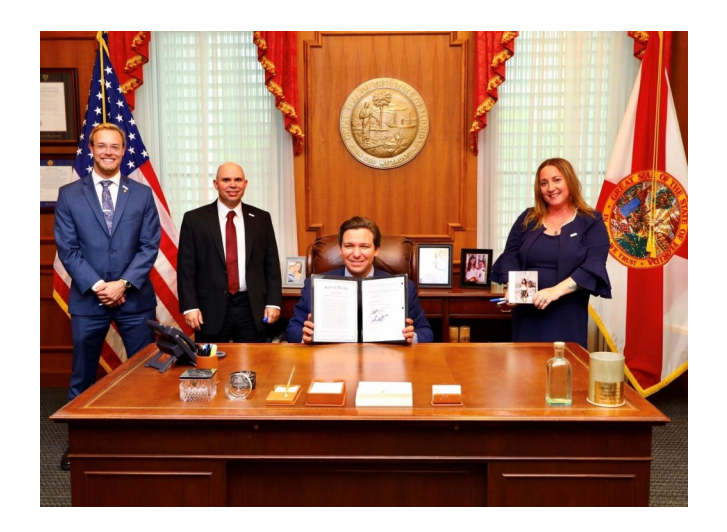
Gov. DeSantis pictured signing "Alyssa's Law"