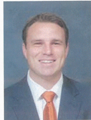
REP WILL WEATHERFORD