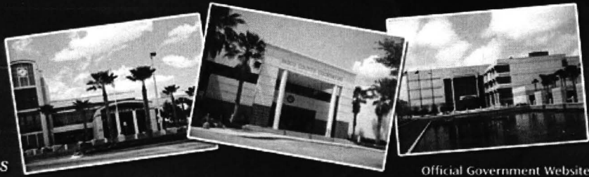
Official Government Website