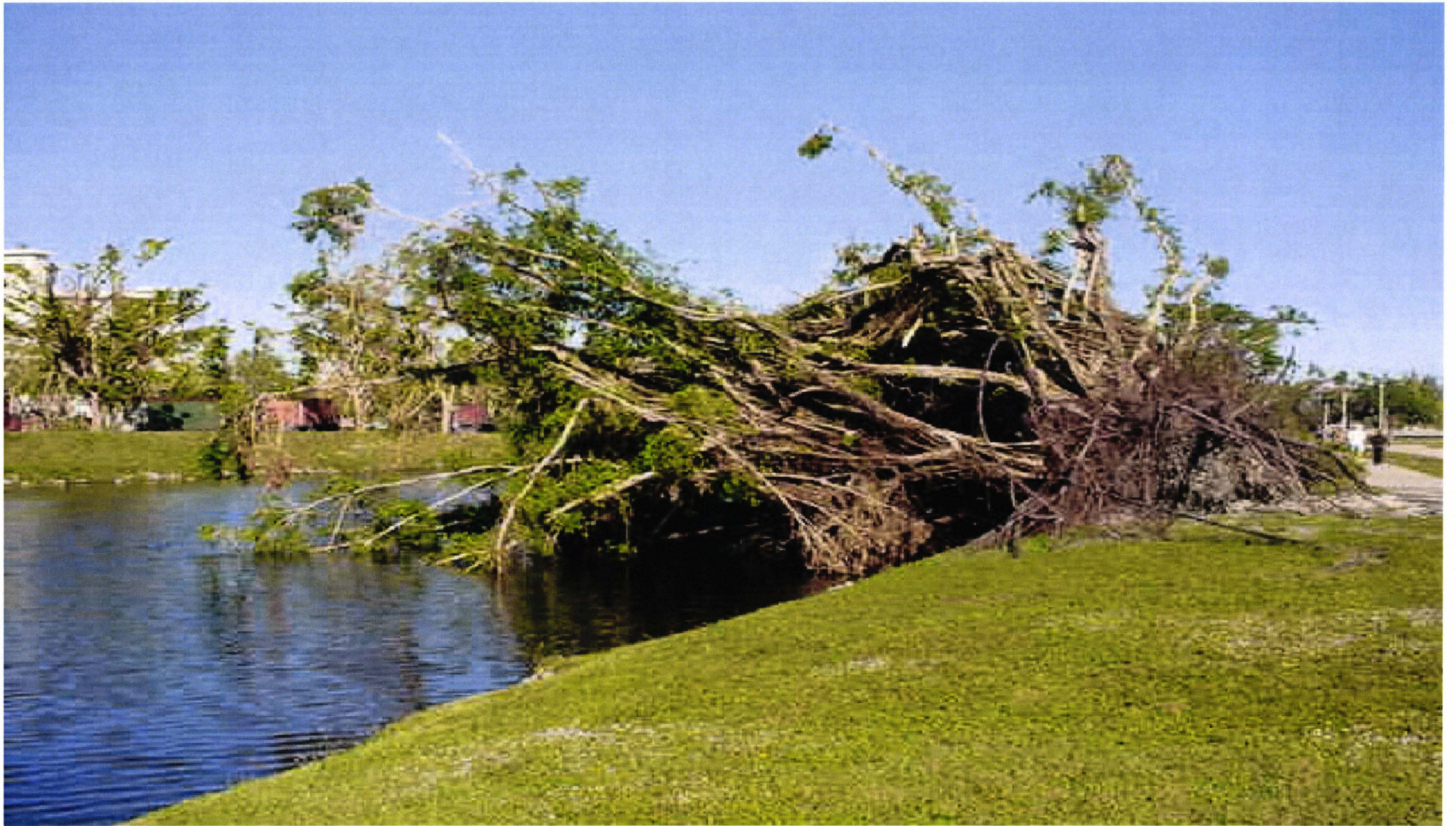
Hurricane Wilma - C-14 Canal (City of Pompano Beach)