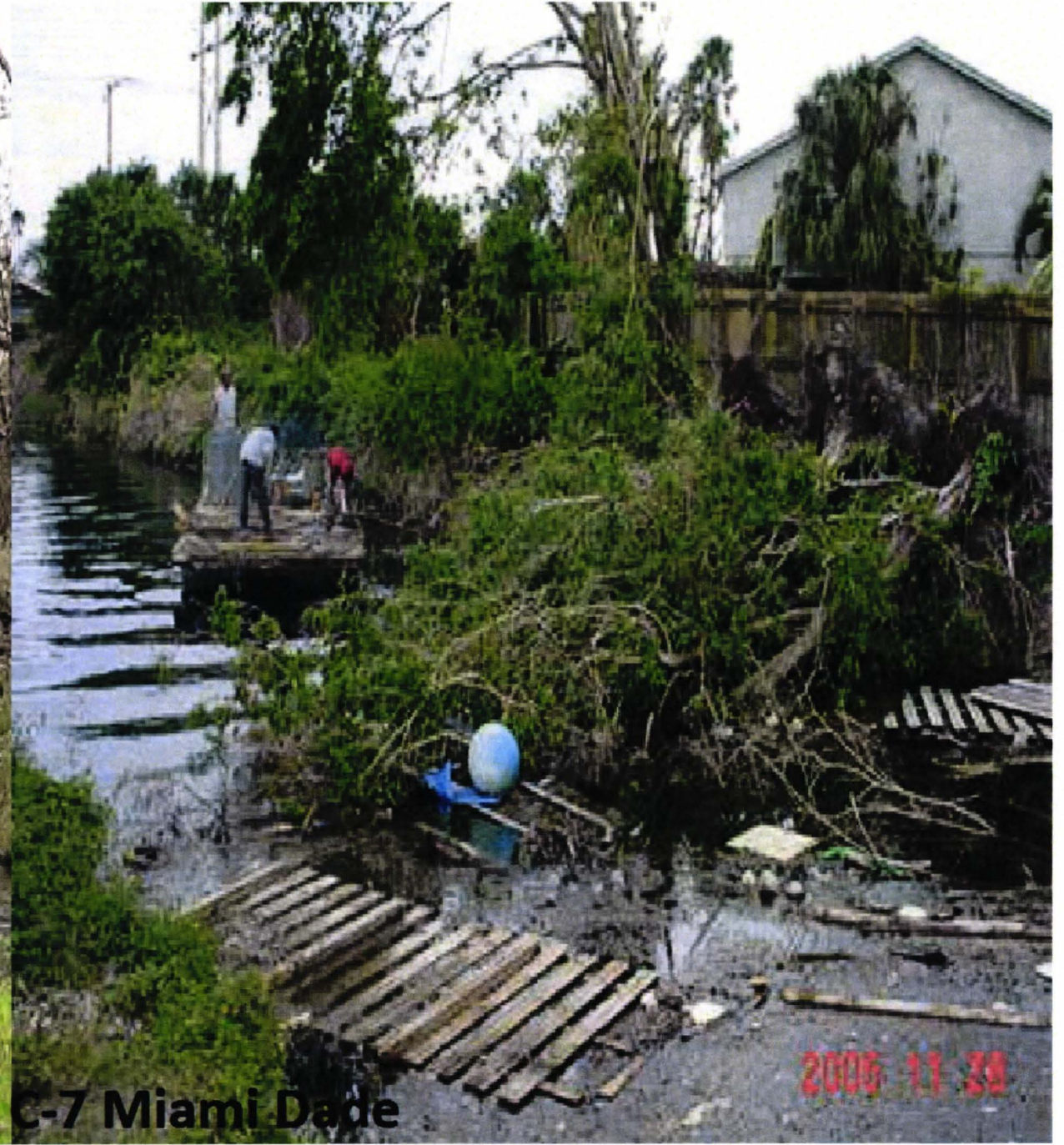
C-7 Miami Dade