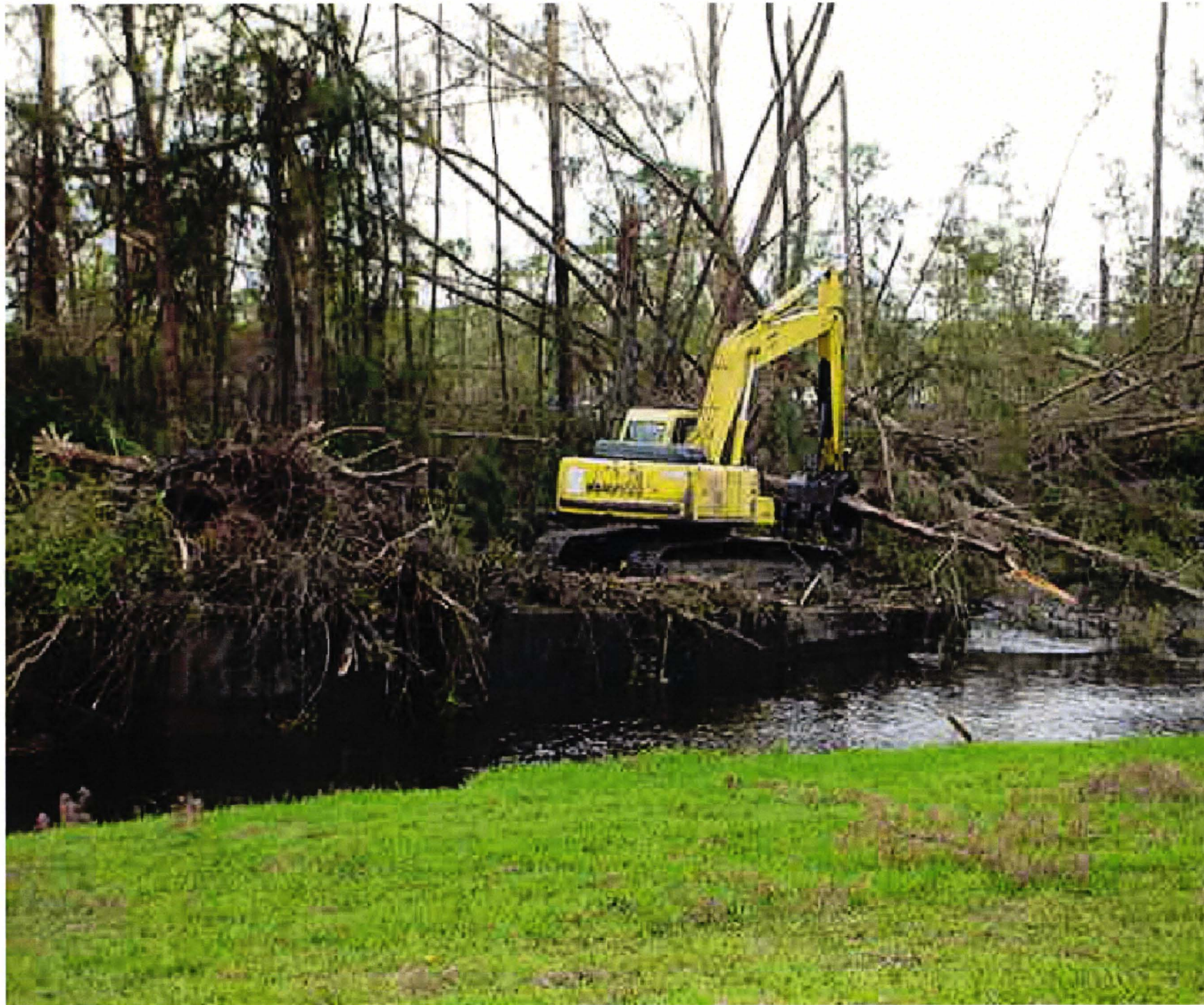
Hurricane Wilma G-08 Hillsboro Canal (unincorporated Broward)