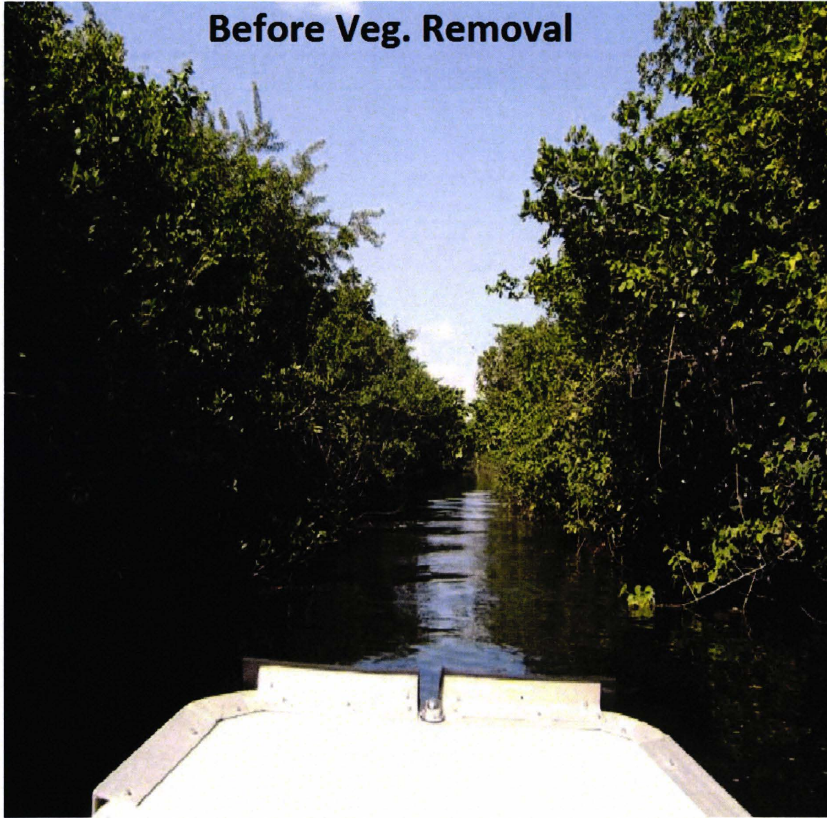
Before Veg. Removal