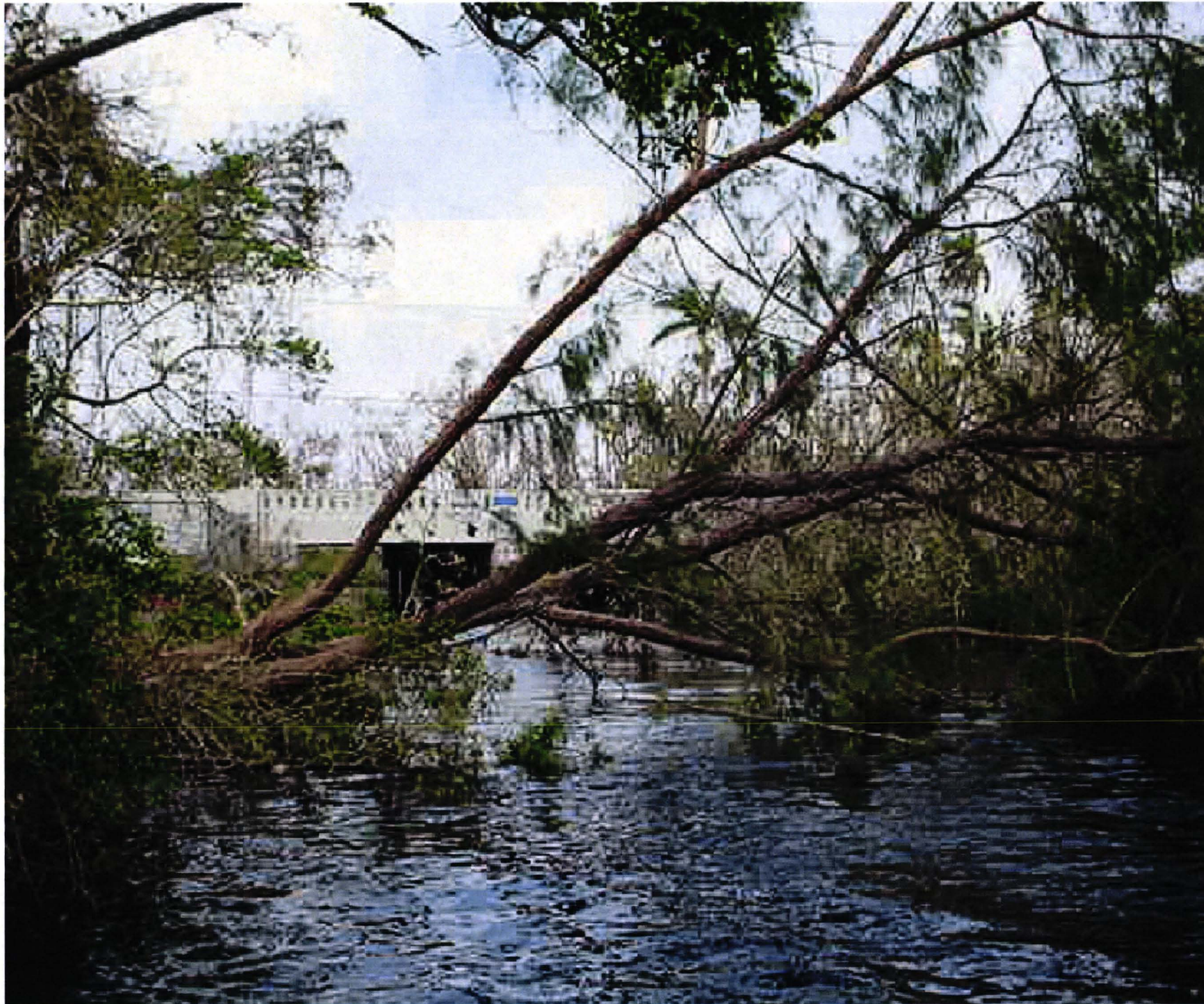
Hurricane Wilma — C-13 Canal (City of Wilton Manors)