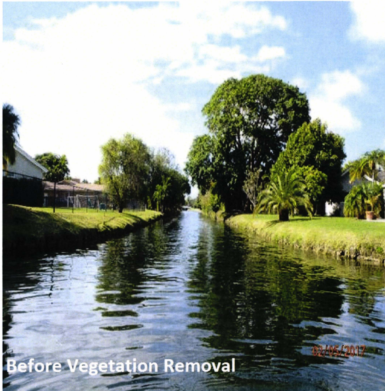
Before Vegetation Removal