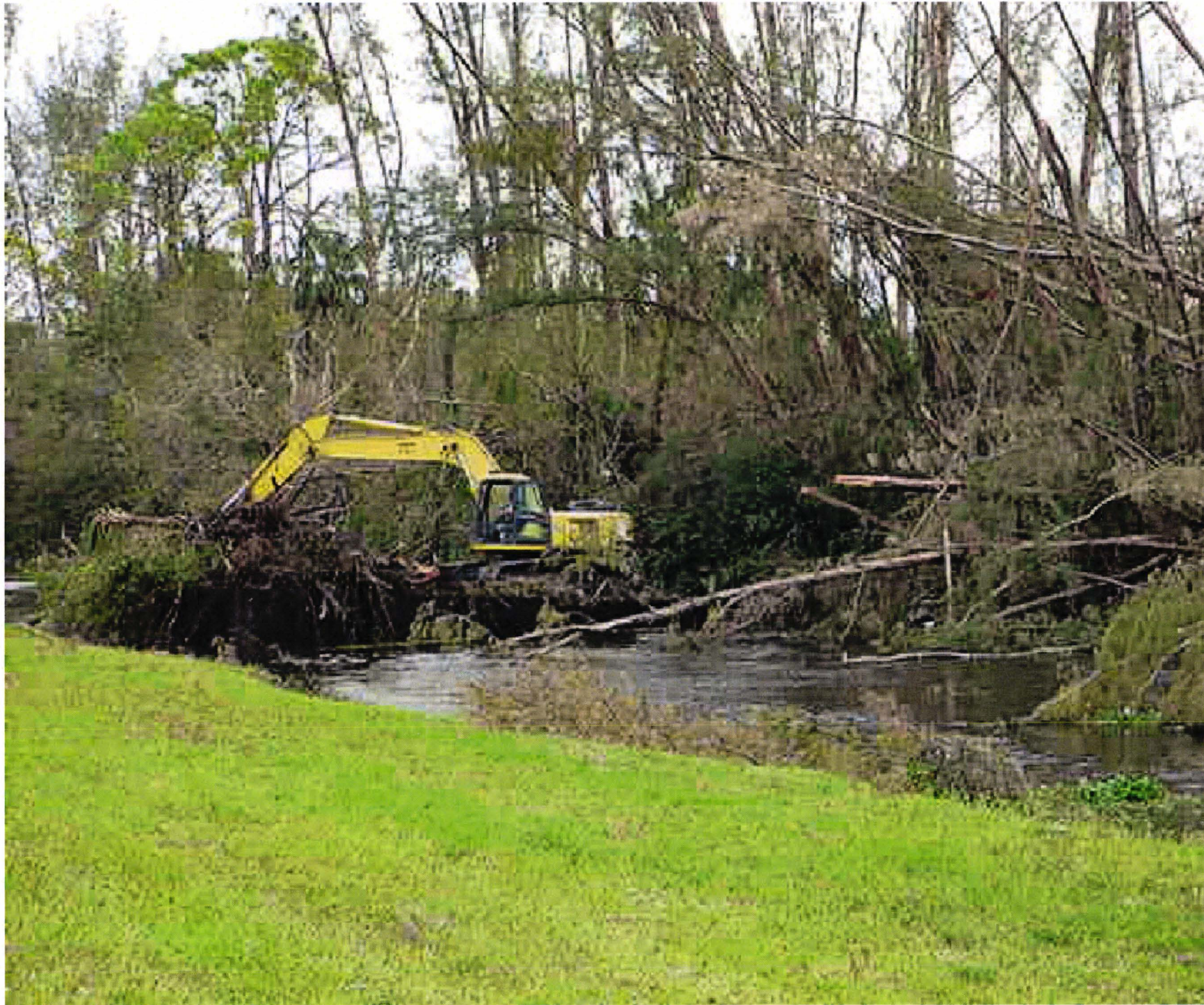
Hurricane Wilma: G-08 Hillsboro Canal (unincorporated Broward)