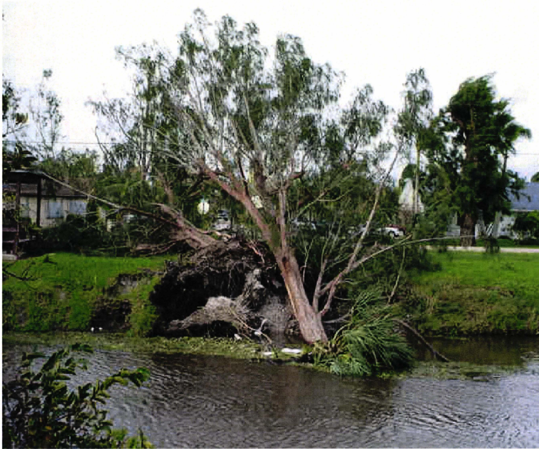
Hurricane Wilma - C-11 Canal (City of Davie)