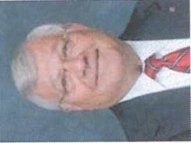
Rep. Heller Dist. 52 - Pinellas