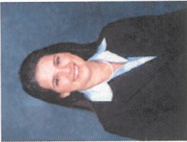
Rep. Flores Dist. 114 - Miami