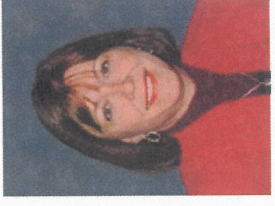
Rep. Vana Dist. 85 - Palm Beach