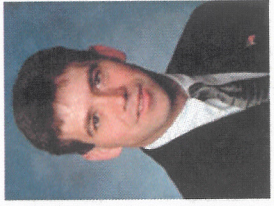
Rep. Legg Dist. 46 - Pasco