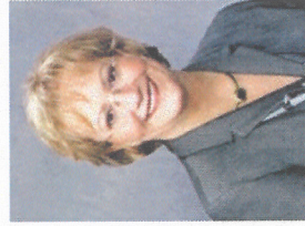
Rep. Long Dist. 51 - Pinellas