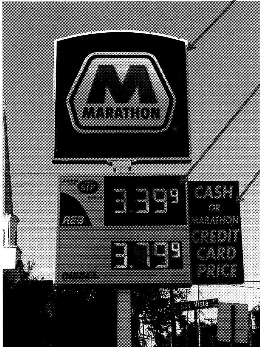
Image controlled by Oil Co. Franchise image - City or County control on sq ft of signage for permit - very limited on size in certain jurisdictions and not allowed in others. -

Industry is moving to a digital format - generally only regular and one other grade posted - very expensive to retrofit - $10,000 or more per sign.