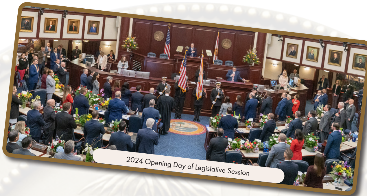
2024 Opening Day of Legislative Session

Applicants must be a Florida resident or be enrolled in a Florida school at the time of application. Applicants must have received their bachelor's degree and be enrolled in a graduate program prior to beginning the Legislative Fellows Program. Law school students must be a 2L or 3L to be considered for the program.